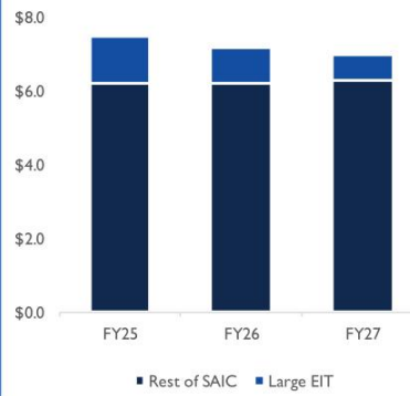
Revenue Composition ($ in B)